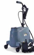
PS 4/7 ELECTROSTATIC SPRAYER