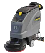
B 40 W with D 51 head