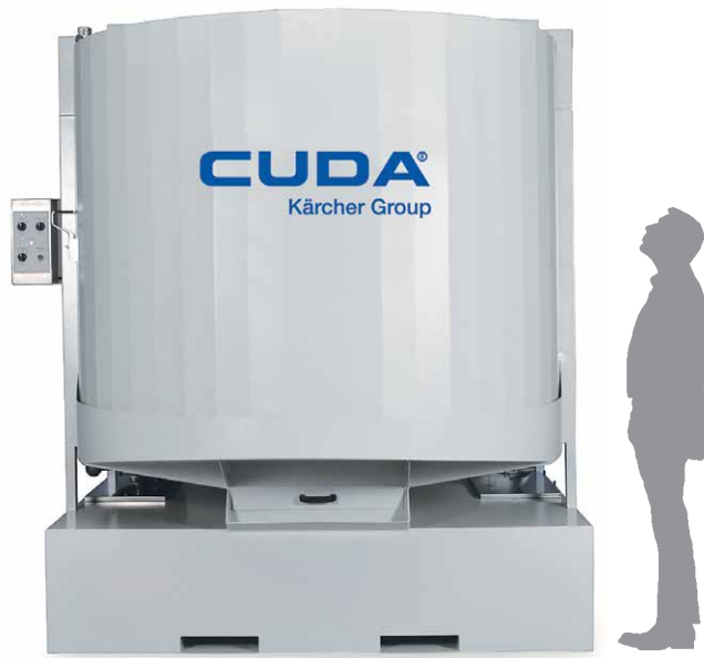
Approx. scale to 7272 model